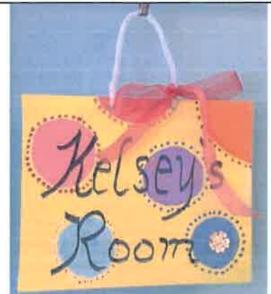
Children's Room Sign