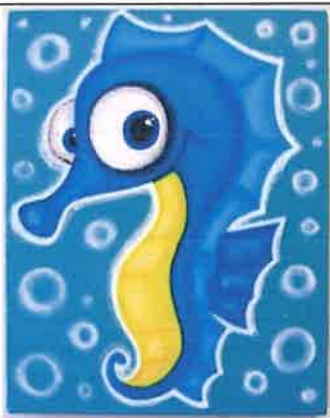
Under the Sea Sea Horse or Fish