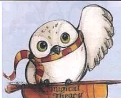
Harry Potter's Owl