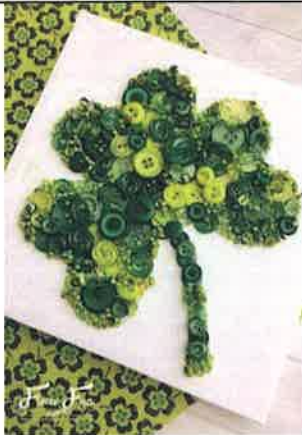
St Pat's Day Project