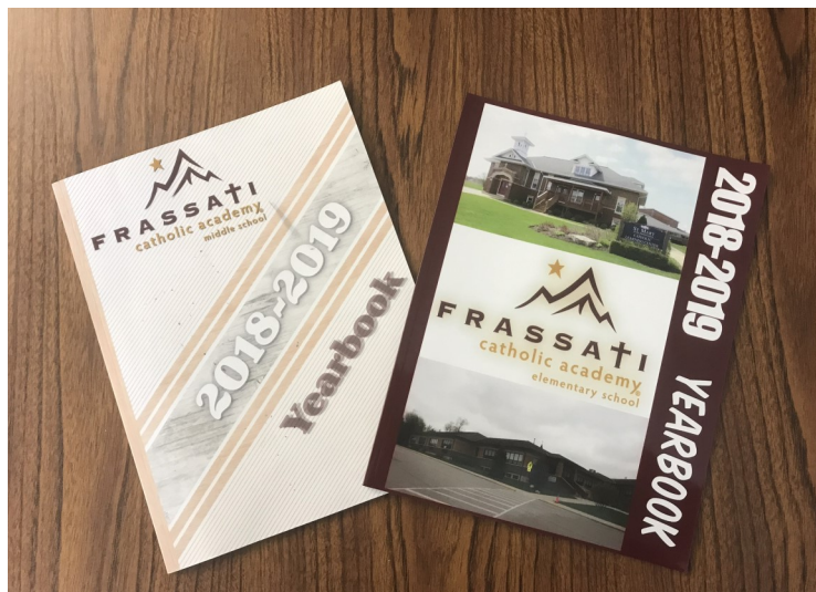
The front covers of the Middle School (left) and Elementary (right) Yearbooks from last year.