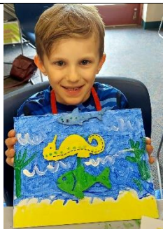
Ocean 3D Art