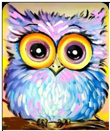
Pencil / Crayon Art

This Course is directly after school on Mondays for 1 hour: 3:15 to 4:15pm. Pickup is at the front door facing Mill Street if you are late you can pick your child up at the After-School-Care class. Each Student should bring a treat/drink for themselves